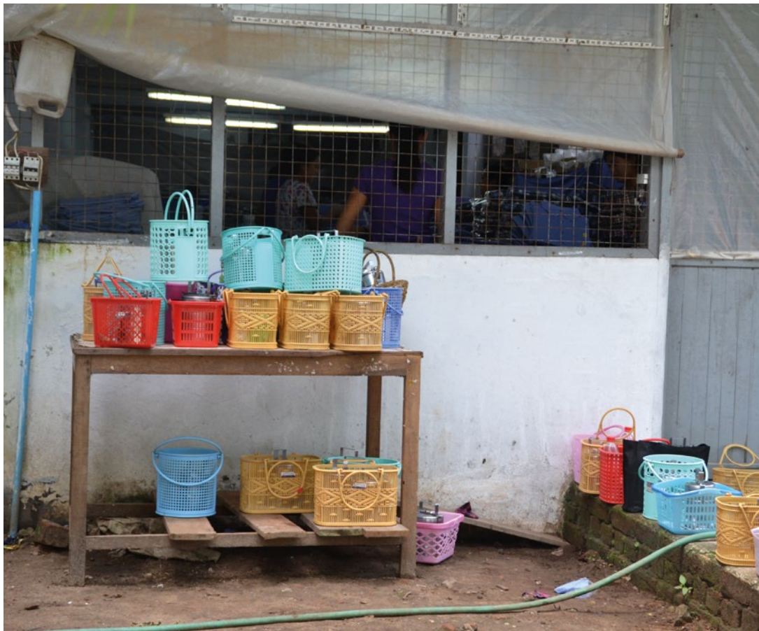
A garment factory in Myanmar (this factory was not included in the research).

At Factory 5, more than half of the interviewed workers were aware about trade union rights, as they had been in contact with ALR on different occasions. Some of the interviewed workers said they were interested in forming a trade union.