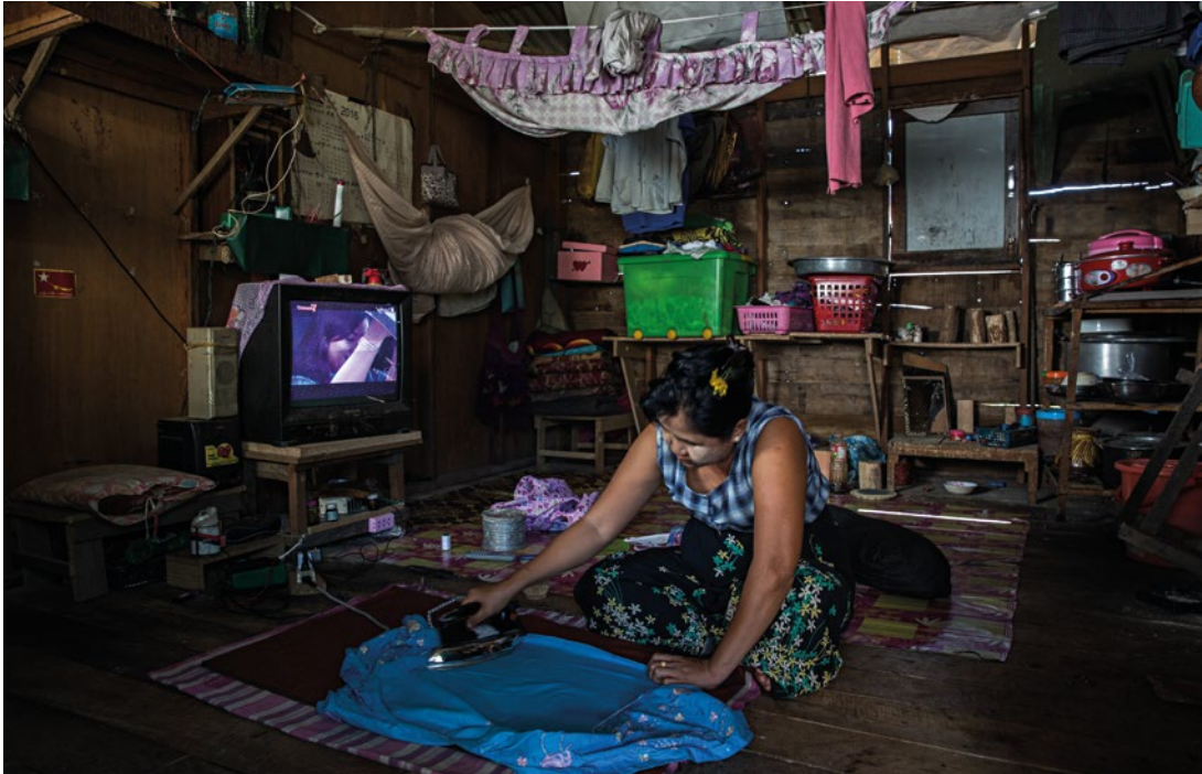
A woman irons clothes in her home.

Employers should, as a standard practice, conduct thorough age checks when hiring workers by checking their documents (NRC, township registration or birth certificate) and requiring a medical check. Young workers of 16-18 years old can only be employed with a valid CoF. Employers should be aware of unqualified medical bodies issuing forged certificates and NRCs. The employer should cover costs of CoF examinations. Buying companies, in turn, should be aware of their suppliers' administration and records being peppered with falsified documents.