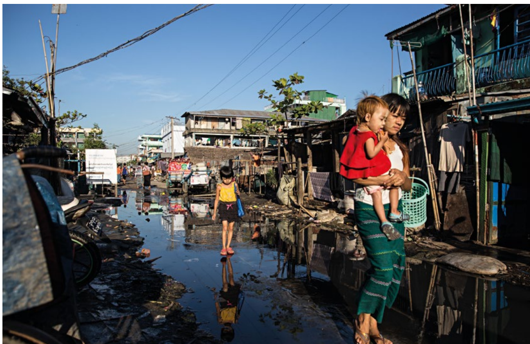
A woman and children walk down the flooded streets of Yangon's Hlaing Tharyar industrial Zone, an area that houses many garment factory workers.

Moreover, the current administration relies heavily on civil servants who served under the previous government – including, for example, the Director General and the Secretary of the Ministry of Labour. District and township level dispute handling bodies are also still run by civil servants who have been in post since the days of the military regime.